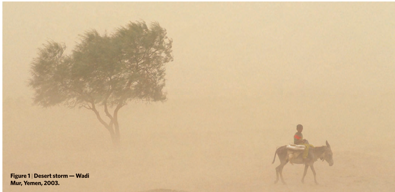
Figure 1 | Desert storm — Wadi Mur, Yemen, 2003.